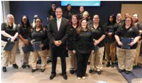
Honoring 911 Operators