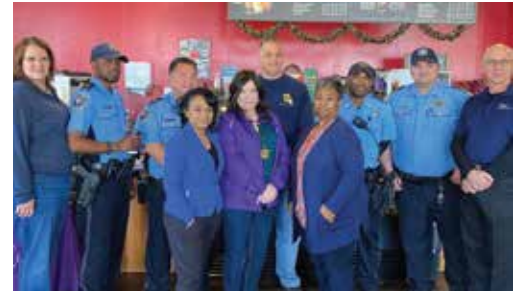
Kiwanis First Responders Day at P.J.'s