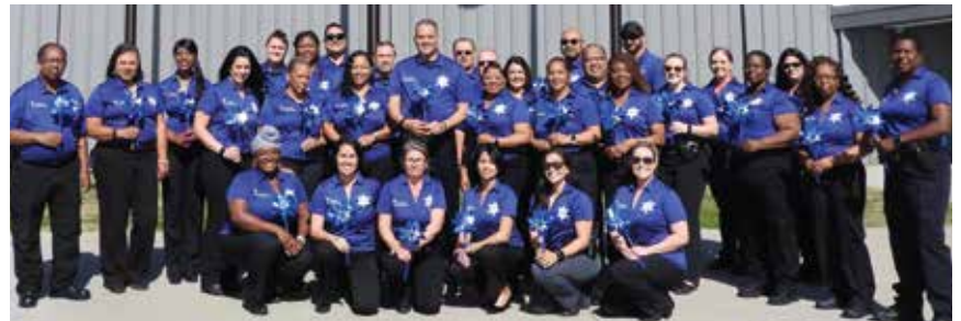
Pinwheels for Child Abuse Prevention