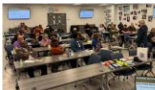
A Church Safety Seminar at the LBJ Training Center

For more information about the next class at the LBJ Training Center call 985.359.8685.