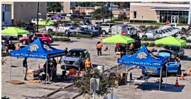
The seat event at our main office is always popular.

SJSO deputies certified as car seat technicians provide free safety checks for residents to ensure that children are in the right seat for their height, weight and age. Visit our web site, stjohnsheriff.org for info on the next event.